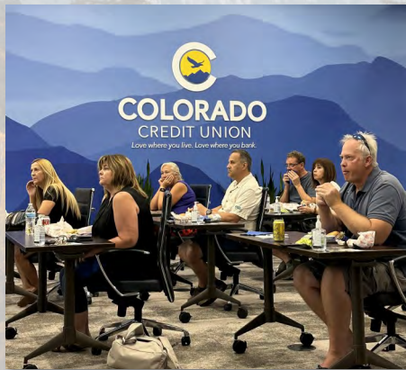
Lunch and Learn